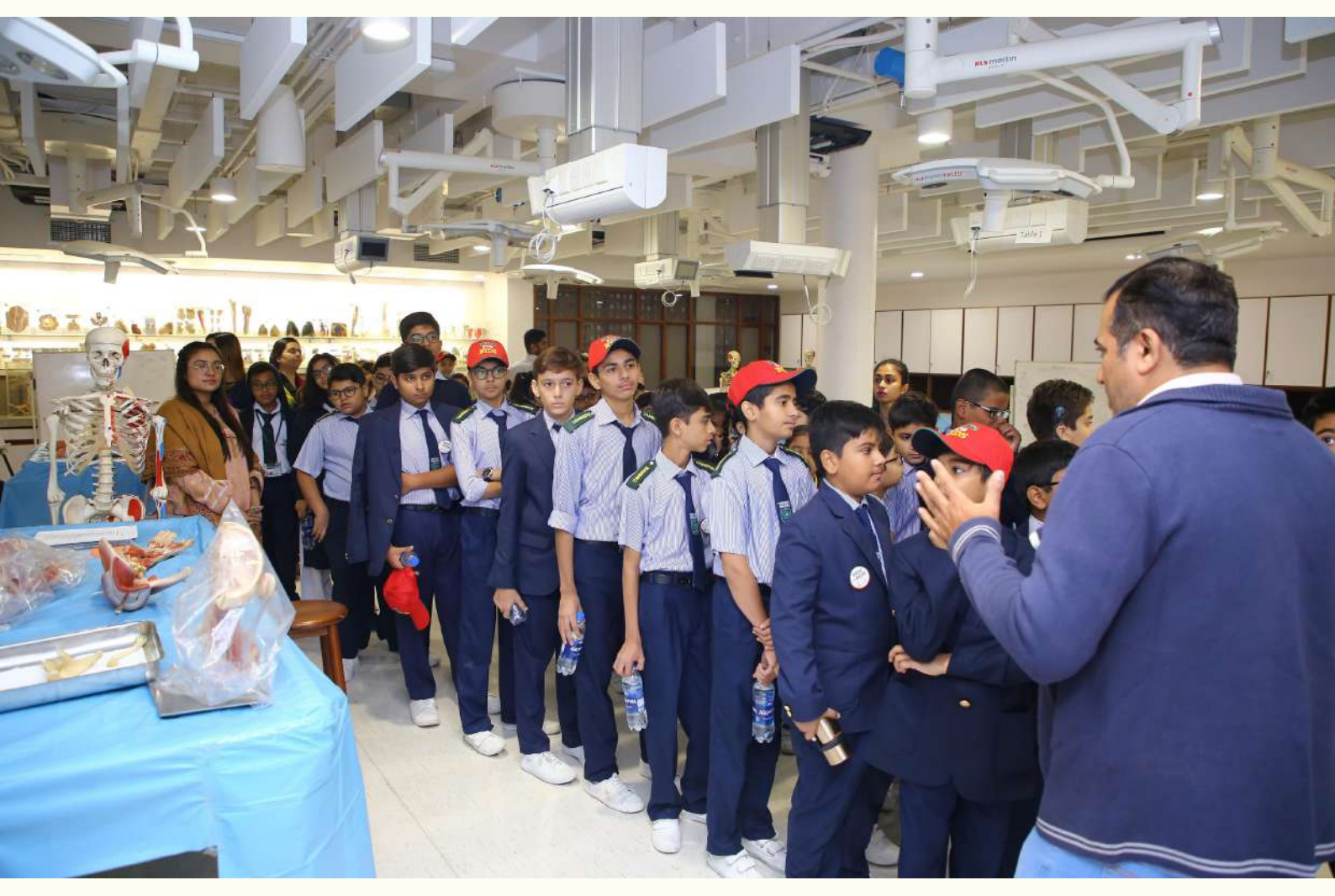
Students from Meritorious School at the Anataomy and Surgery Learning Studio at the Aga Khan University Stadium Road Campus