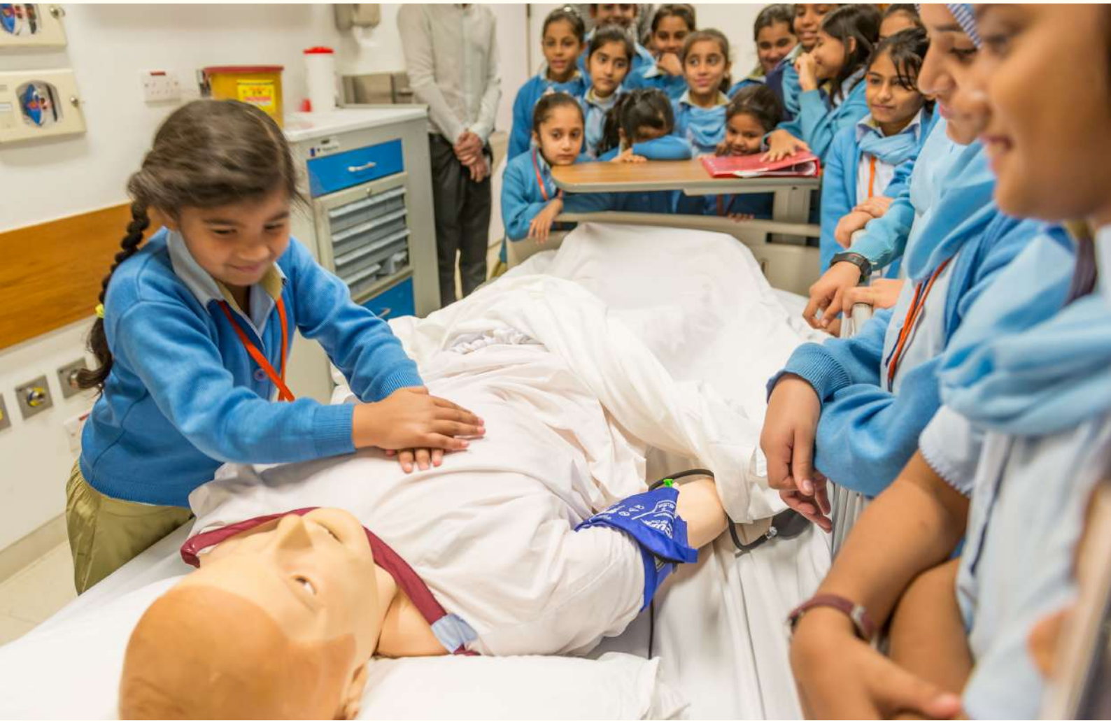
A young donor from Dawood Public School practicing resuscitation on one of our patient care simulators at the Centre for Innovation in Medical Education, at the AKU Stadium Road Campus in Karachi