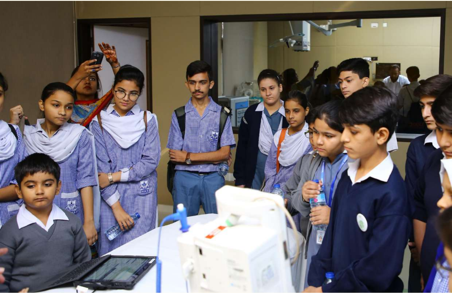
Students from Happy Home School receiving a demonstration at the Centre for Innovation in Medical Education at the Aga Khan University, Stadium Road Campus