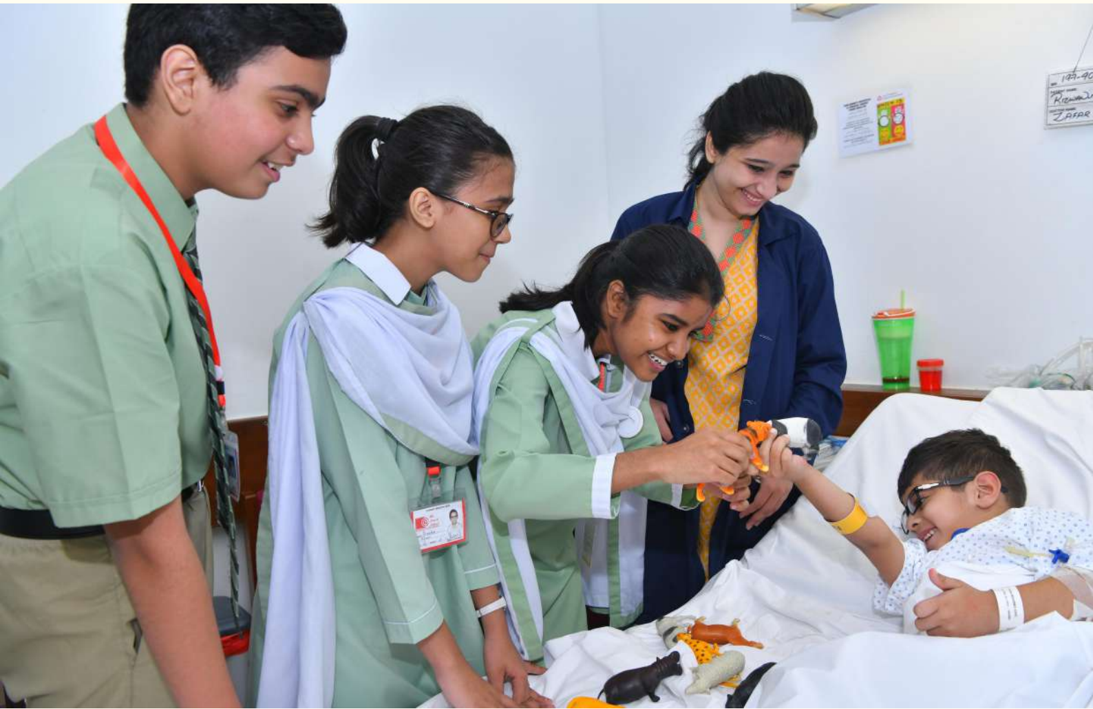
Students from The Smart School visiting young patients at the Aga Khan University Hospital, Paediatric Ward