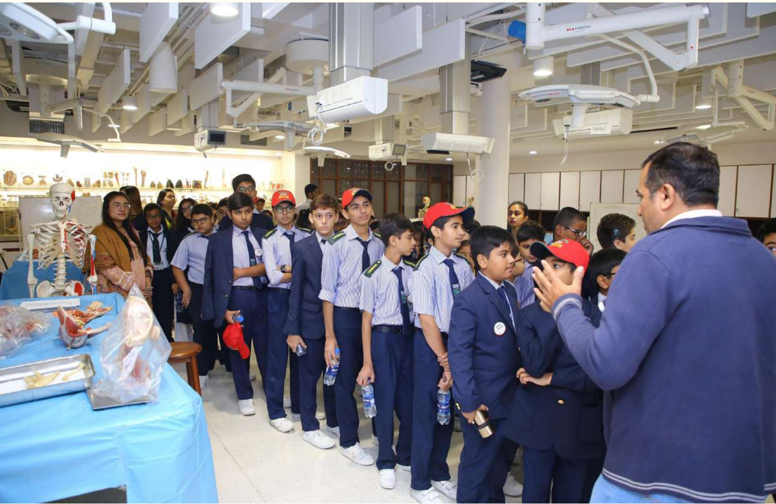
Students from Meritorious School at the Anatomy and Surgery Learning Studio at the Aga Khan University Stadium Road Campus