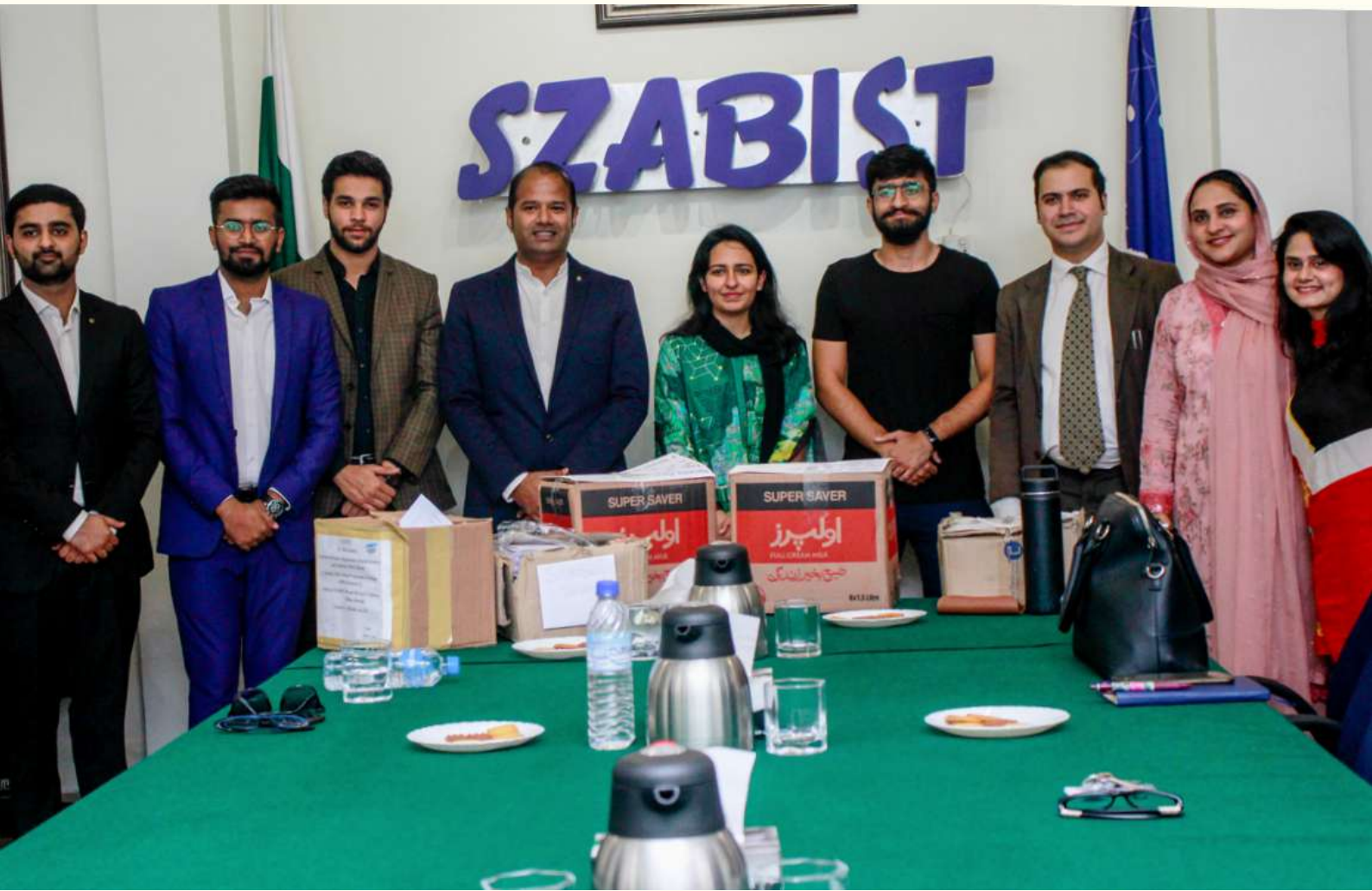
The School Programme Team visited the SZABIST campus